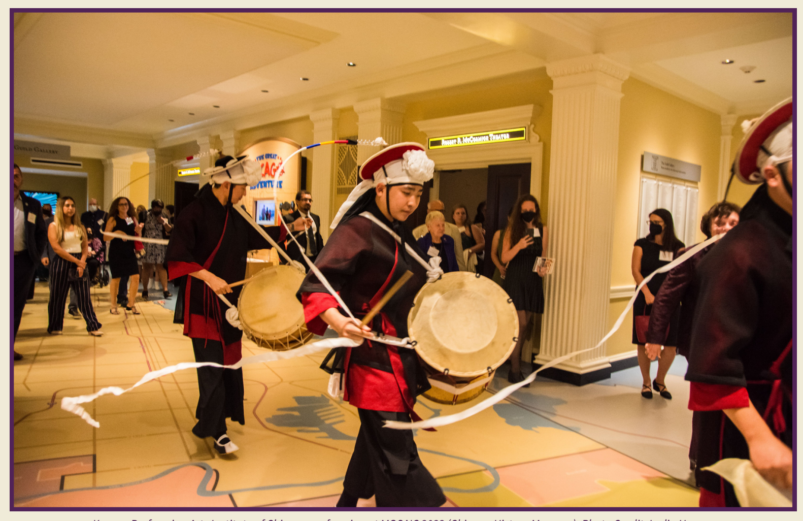
Korean Performing Arts Institute of Chicago performing at MOSAIC 2022 (Chicago History Museum).